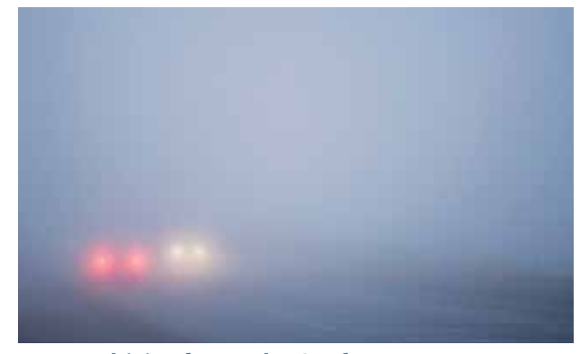
Are you driving fast or slow? In fog you never know. Slow down.

Watch your speedometer. Fog creates an illusion of slow motion - you could be driving faster than you think you are.