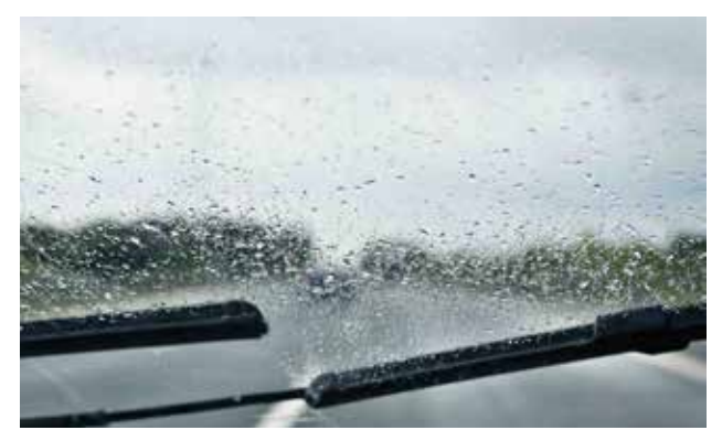
To this...in a matter of seconds.