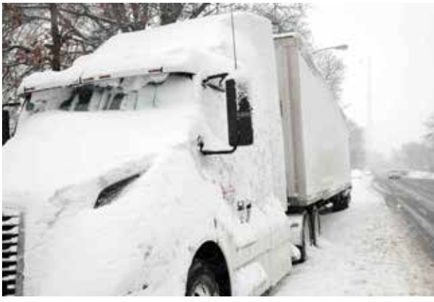
Sweep snow from every part of your vehicle.